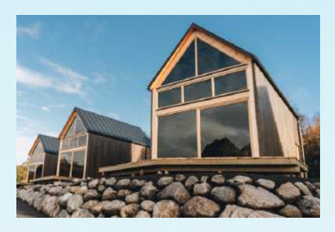
TOP ROW CABINS 3200 NOK

16 Hotel rooms10 Waterfront cabins4 Top row cabins2 Family top row cabins