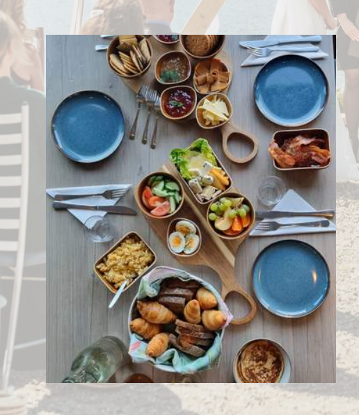
Breakfast 199 NOK/DAY/PERSON