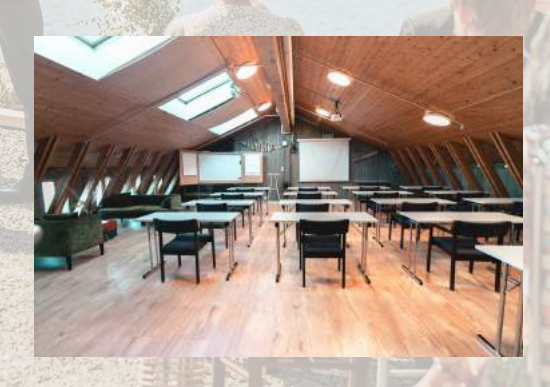
Conference room 4000 NOK/WEEKEND