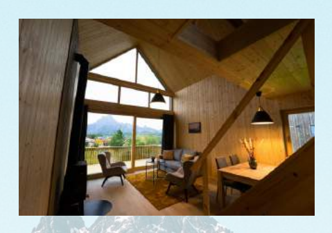
FAMILY TOP ROW CABINS 3700 NOK