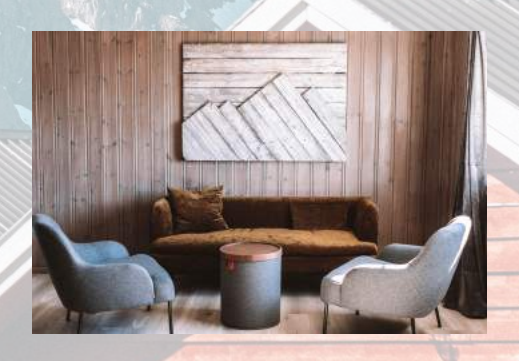
SUPERIOR HOTEL ROOMS 1400 NOK

A minimum of 60 guests is required. Also, all hotel rooms and a minimum of 10 cabins are required to be booked for the wedding guests for a minimum stay of two nights with breakfast service every day.