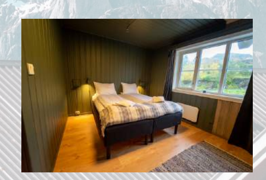
STANDARD HOTEL ROOMS 1300 NOK