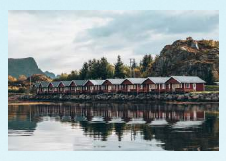
WATERFRONT CABINS 2400 NOK