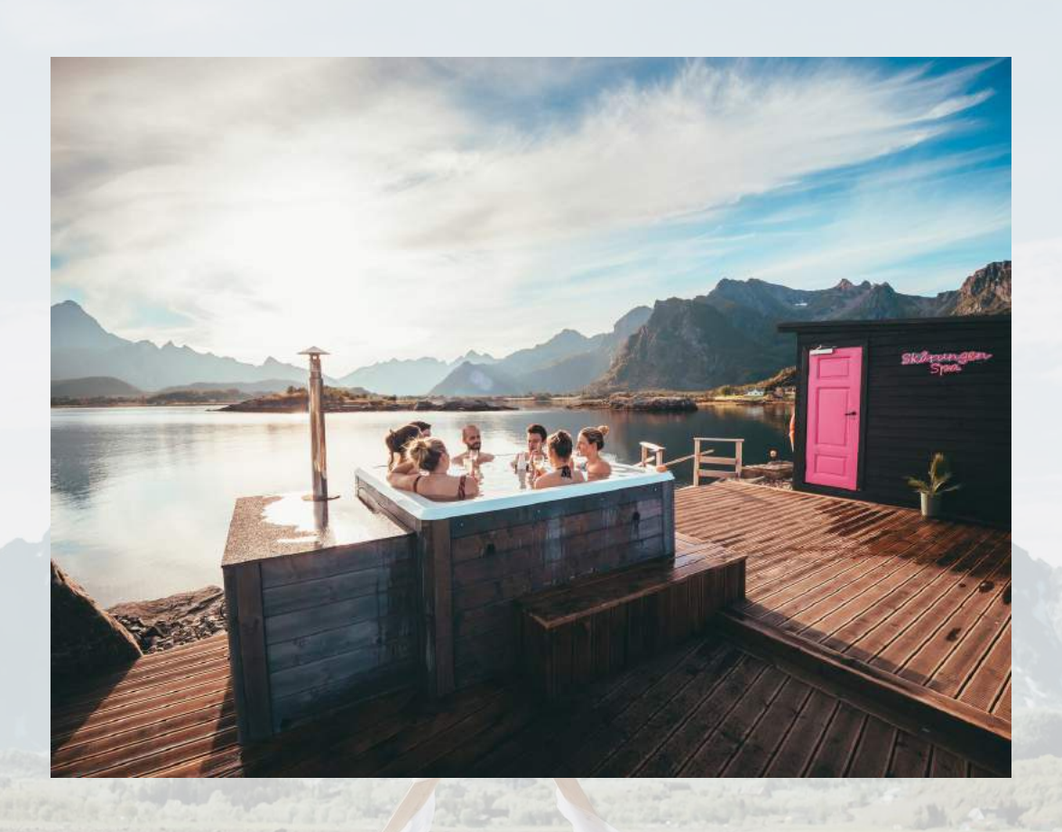
SPA 3500 NOK / DAY